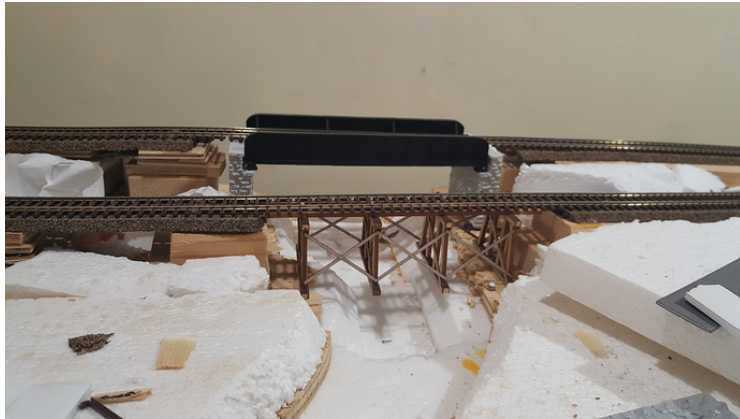
Not much but it's what I'm doing