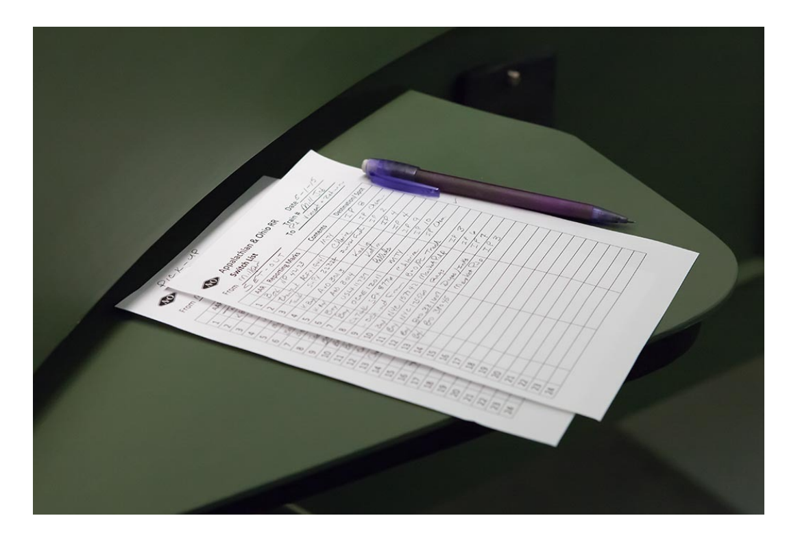
rnb3 #5 February 14, 2016, 10:35pm

Really cool! I cant wait for my chance to operate!