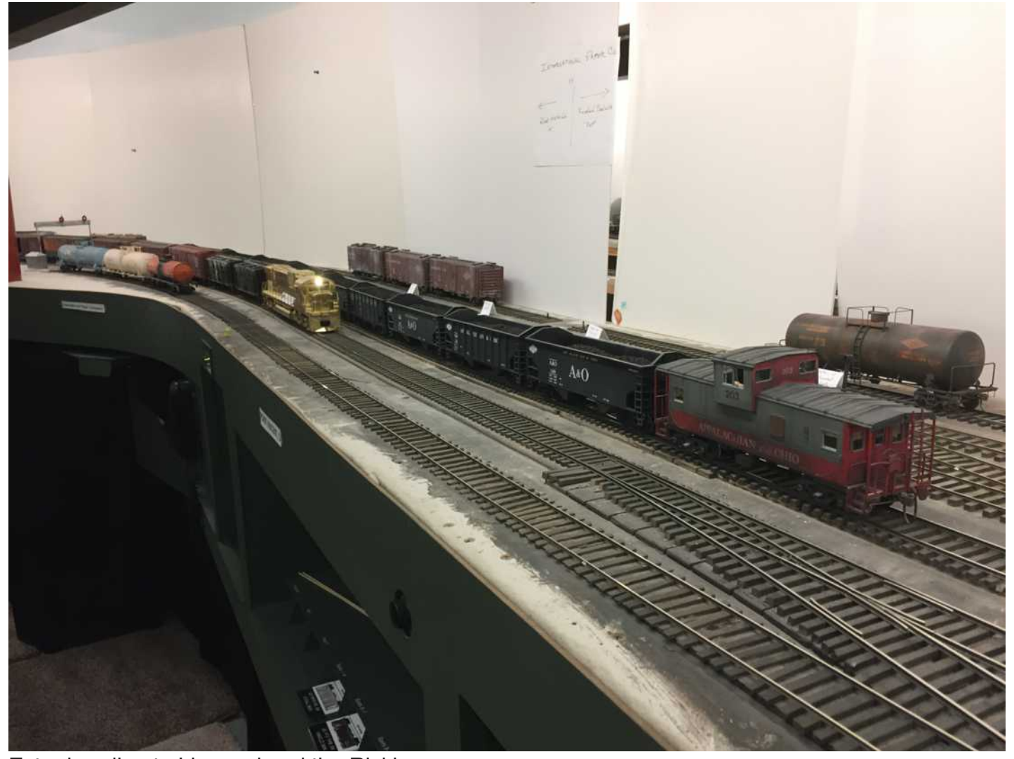
Extra heading to Linwood and the Rickburg.

I've got some video...although not a lot. But I'll try to get some of it edited and put up soon. In the meantime...here are some shots I took.