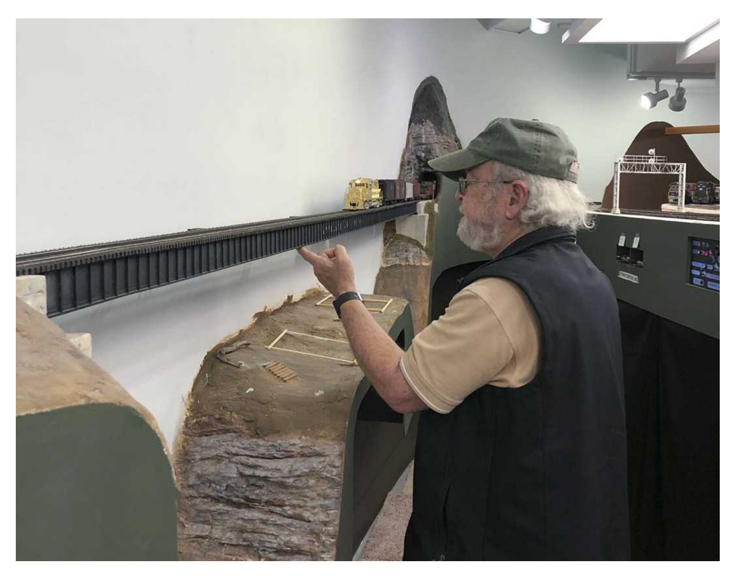
It didn't bend.