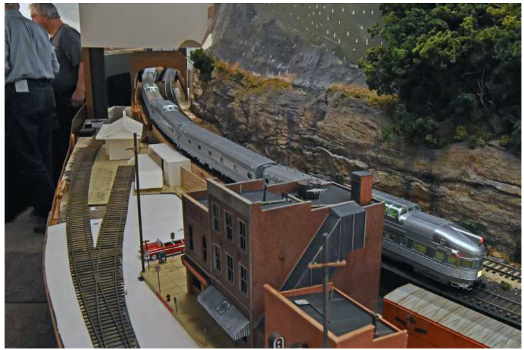
Train #2, the Floridian, makes its scheduled stop in Mount Union, WV.