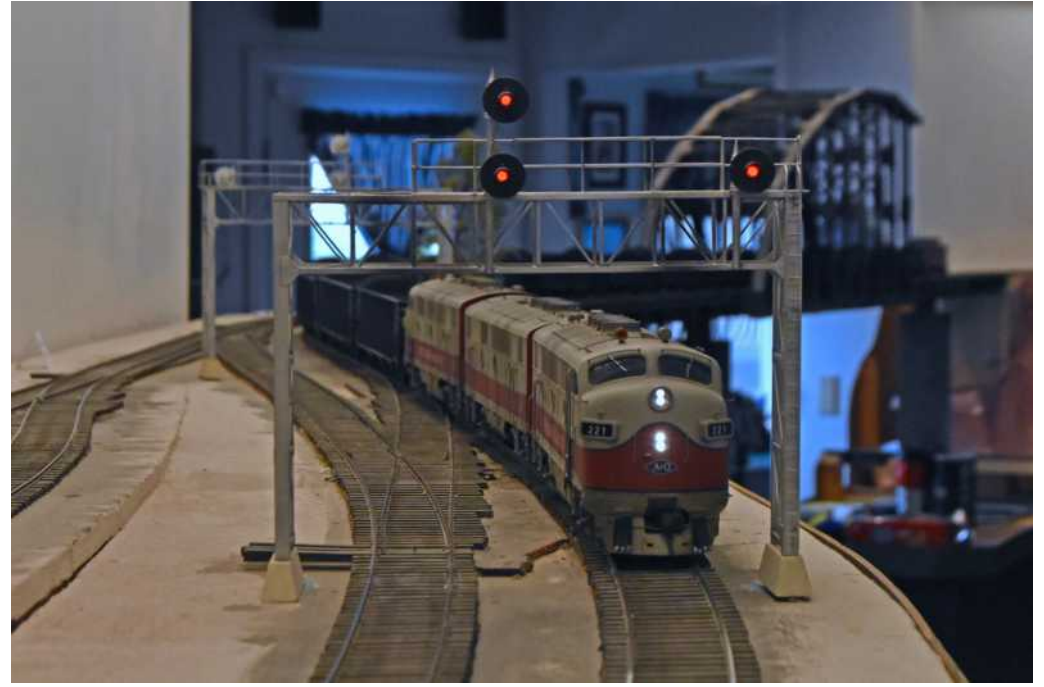
Train 326 drops downhill off the Ohio Bridge with the dynamics howling.