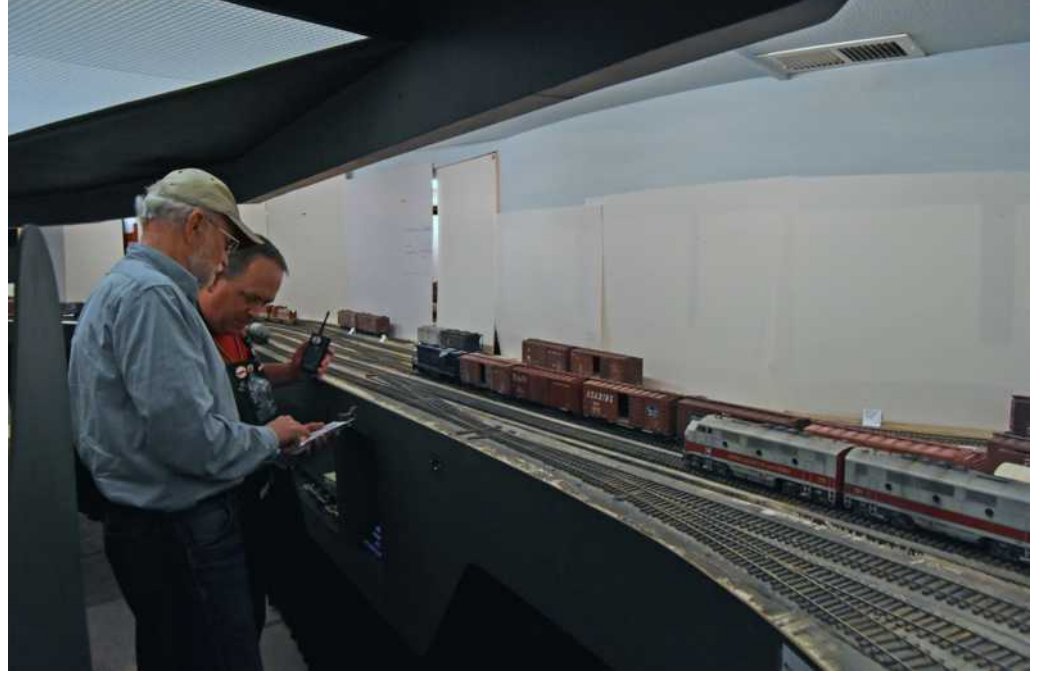
The B&O transfer is setting cars off at International Paper while I scoot by with the F3s.