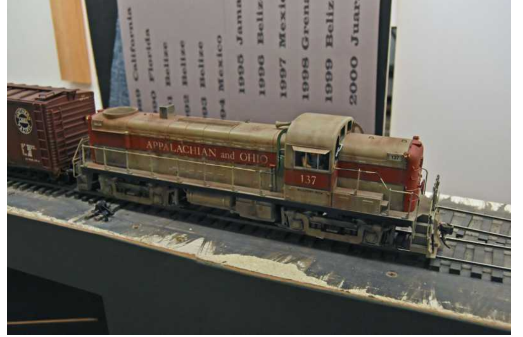
A&O RS3 #137 switches in the Fillmore Heights industrial area.