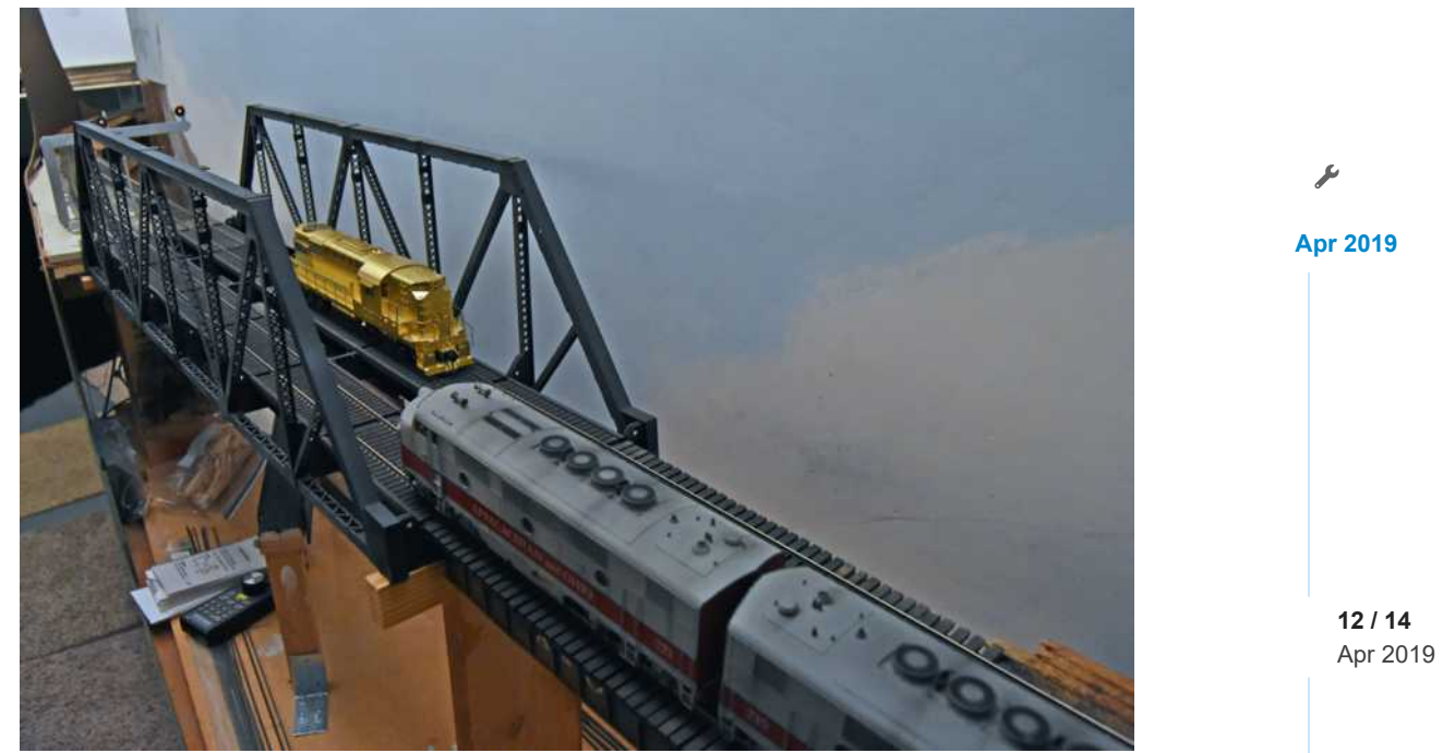
A&O RS11 #145 drifts downgrade at Union Gap after pushing train 262 uphill to Linnwood. It will push a 2nd train up upon return to Apr 2019 Ricksburg.