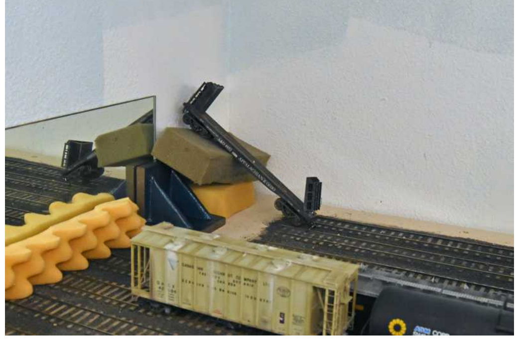
A mishap occurred in the 16th street hump yard when a bulkhead empty was pushed down the ramp instead of guided down the ramp.