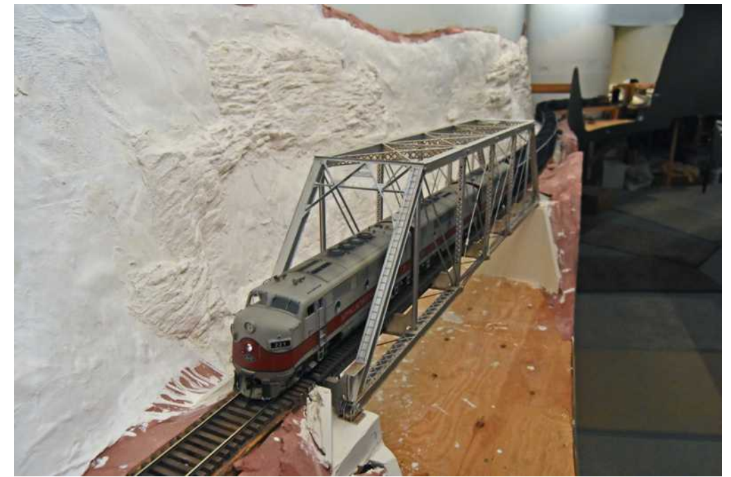
A&O F3 #221 leads a coal load through the river gorge near the Golden Spike monument.