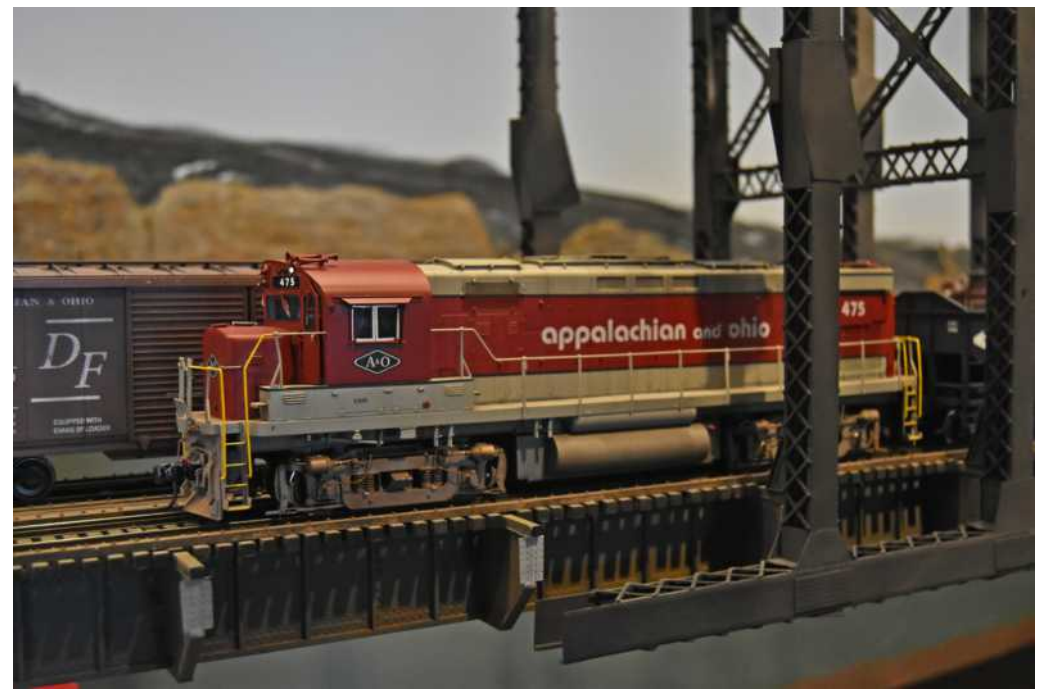
A&O C425 #475 sits on the Ohio River Bridge at the beginning of the session. It is hauling empty coal cars bound for Ricksburg.

Okay, now that I've got a little time out of the way, here's the remaining 10 photos I took from the session, all of which are just of equipment on the RR; "railfanning" shots if you will.