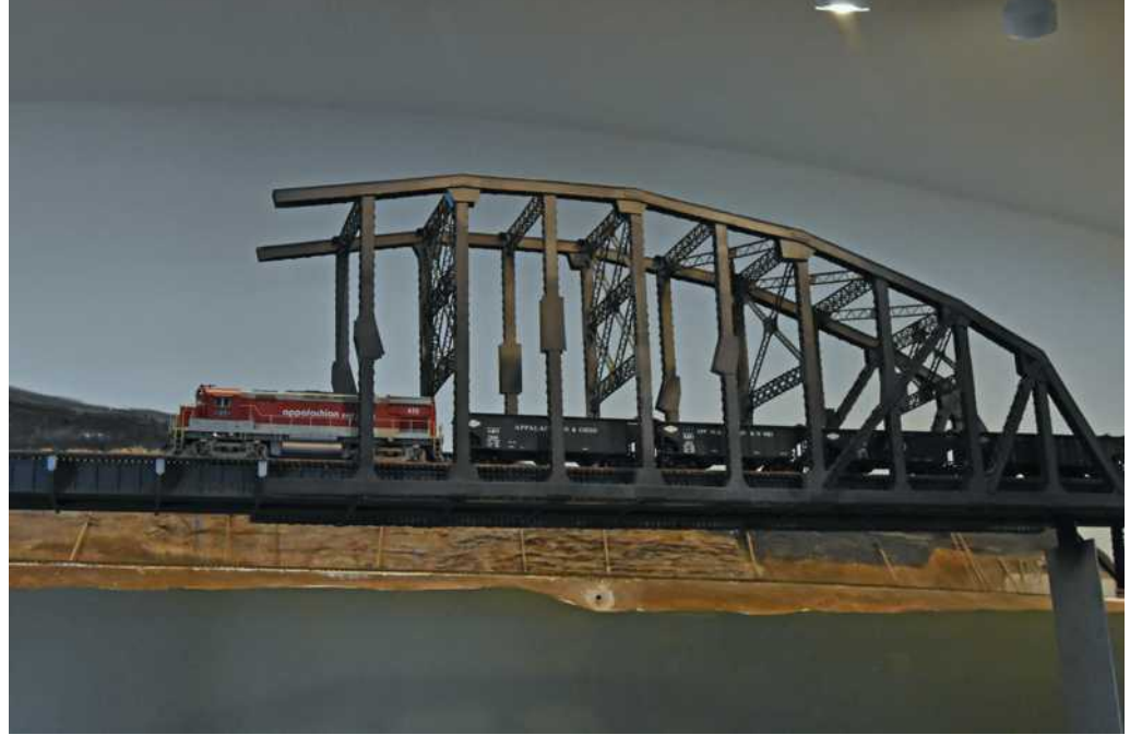
Another look at A&O 475 on the coal train parked on the bridge. This gives a good look at the size of this project.

Op Session March 30 2019 - General - A&O Railroad