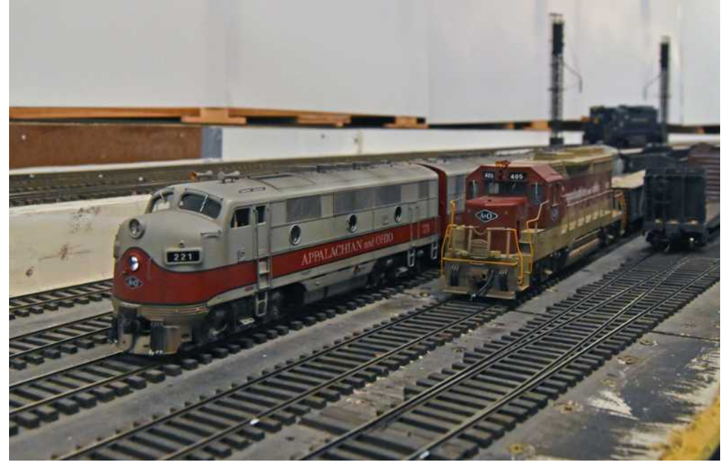
A&O F3 #221 and A&O GP35 #405 sit side-by-side in Haven's Yard in Millport, OH.