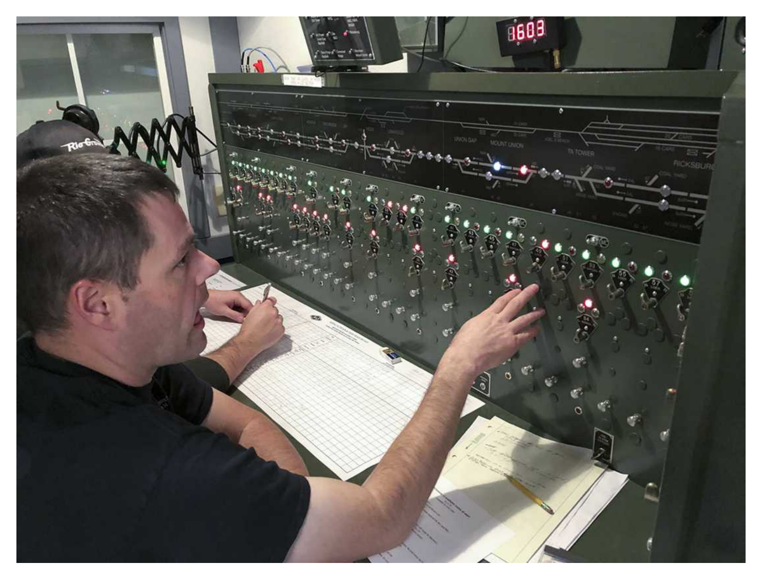
Meanwhile Cody waited for the DS to let him back on the mainline after switching interchange cars in Mount Union.