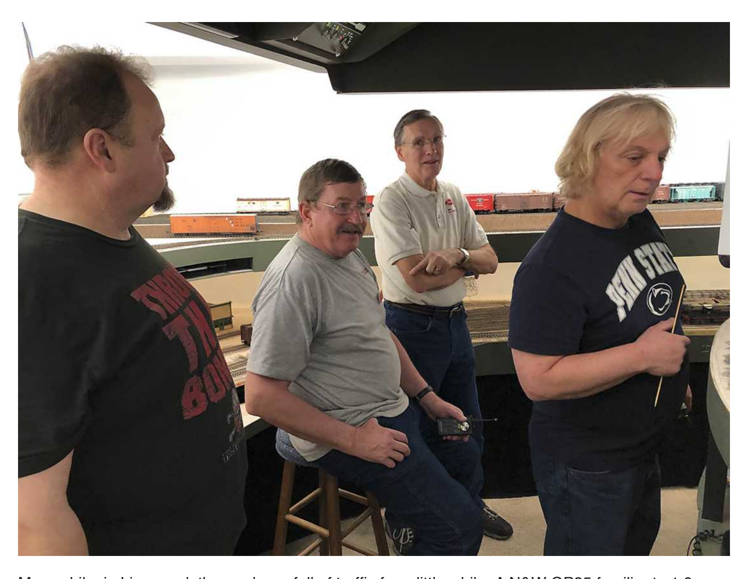
Meanwhile, in Linnwood, the yard was full of traffic for a little while. A N&W GP35 familiar to 1.0 operators runs on the passing while new Also FAs burble two tracks over.