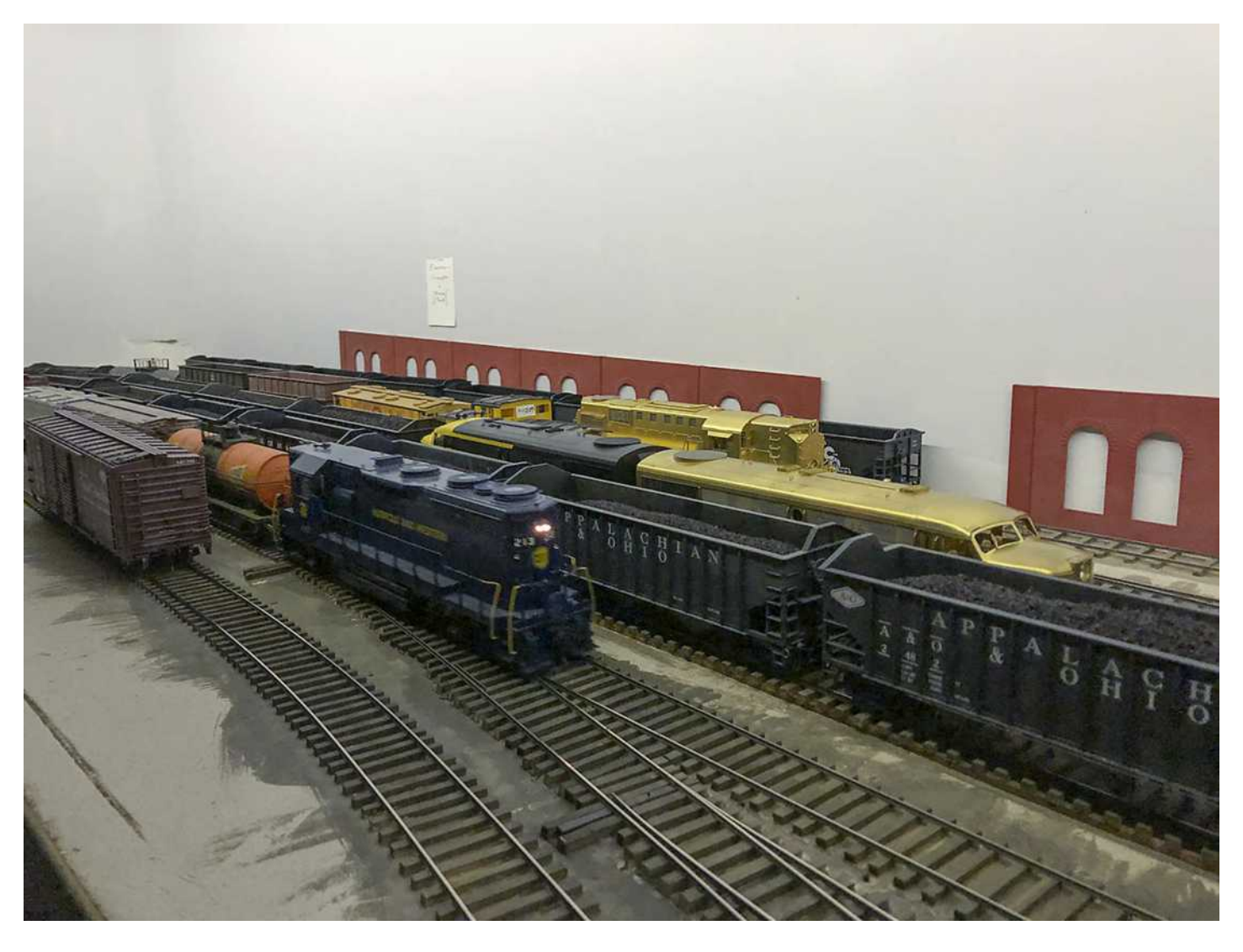
Kirk "the Elder" switches 28 linear feet of International Paper with an SW9 equipped with a Loksound decoder and Tang Band 2008S speaker module.