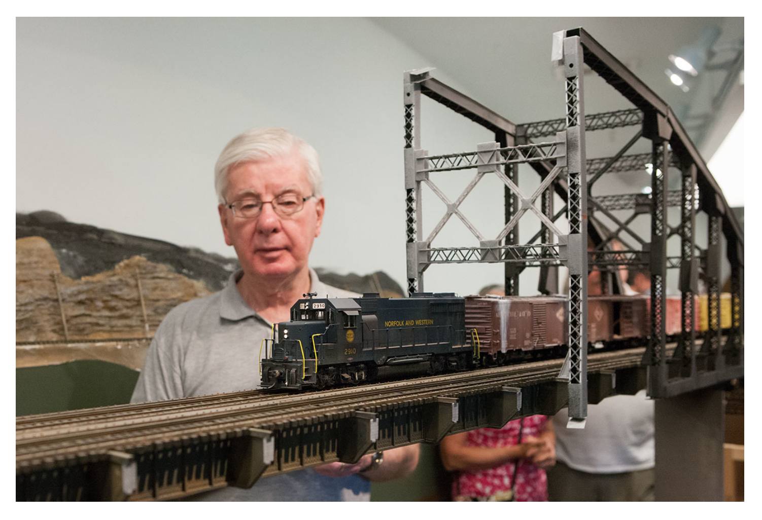
Two happy modelers with 2910 at CP Jay.