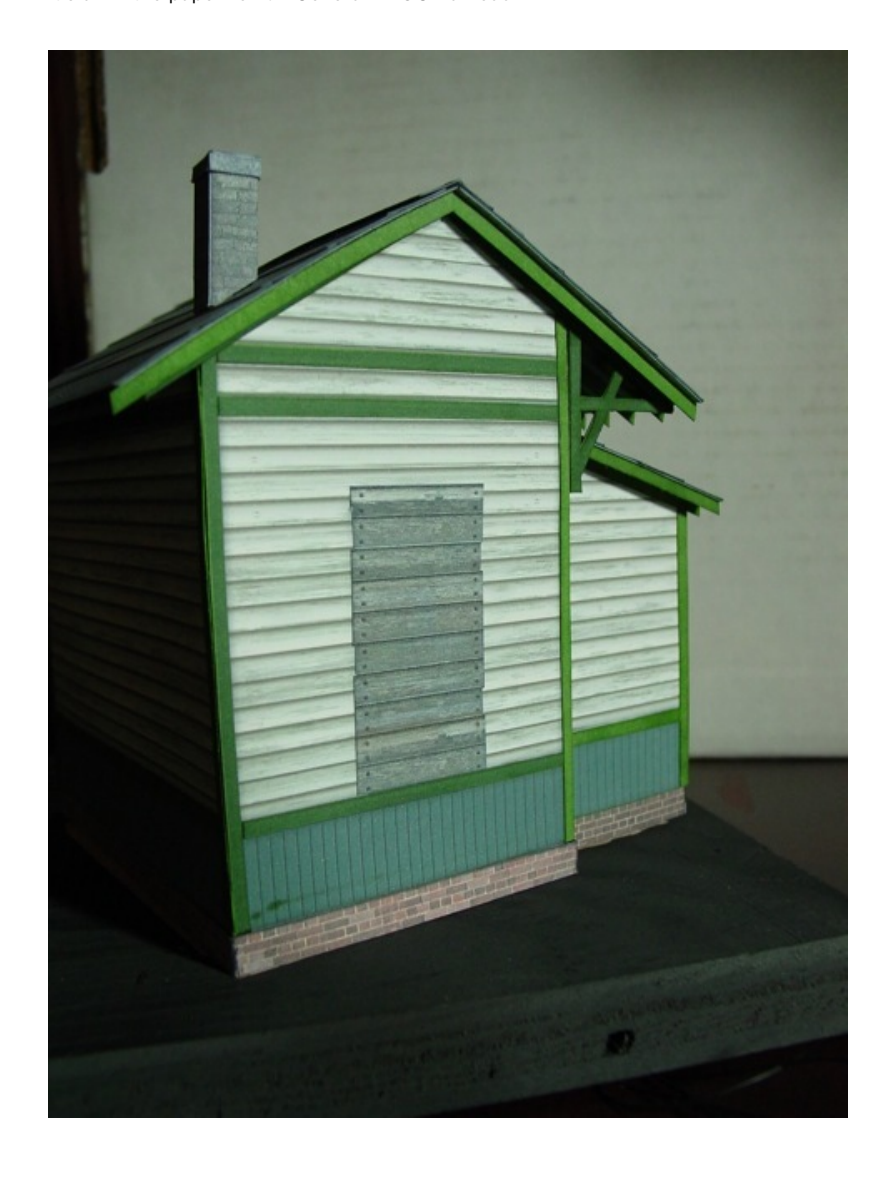
Chester #5 February 14, 2016, 10:33pm

Beauty cool Rick. Are those your colors or is that the way the kit prints out.