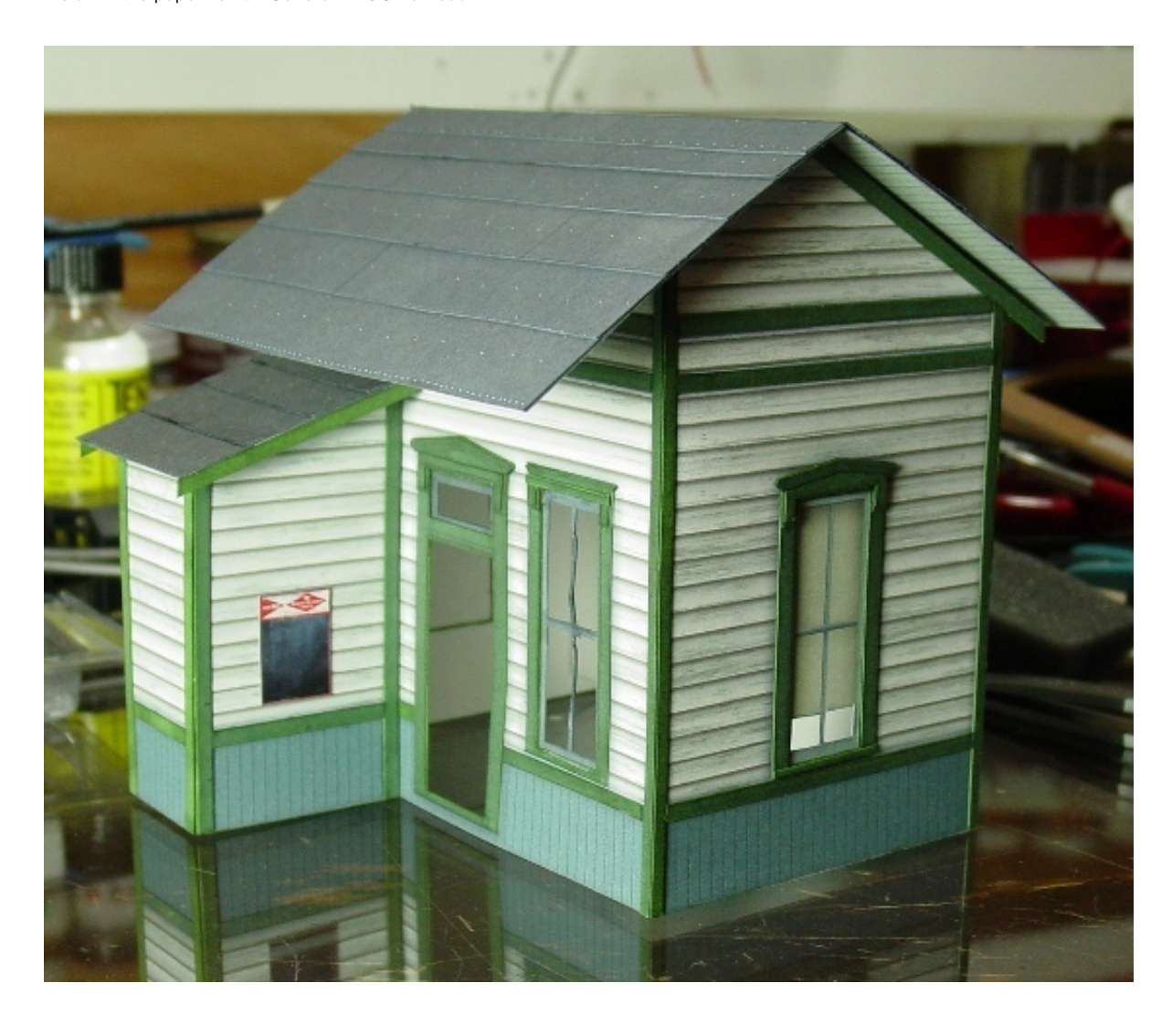
rnb3 #2 February 14, 2016, 10:33pm

It's been a little dead around here lately! I've done a little more work on my paper model experiment. I have added a brick foundation and a full interior.